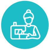
GARMENT FACTORY WORKERS