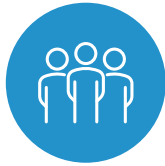
COMMUNITIES AFFECTED BY THE THEMATIC PRIORITIES