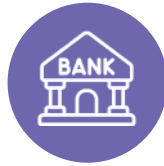
BANK AND FINANCIAL INSTITUTIONS